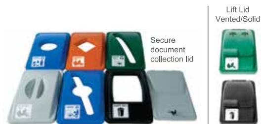
Variety of lids available in many colors