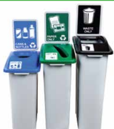
Available in 3 sizes: 16, 20 & 23 Gallon

Email: info@ecosafezerowaste.com Toll Free: 1-855-495-4959