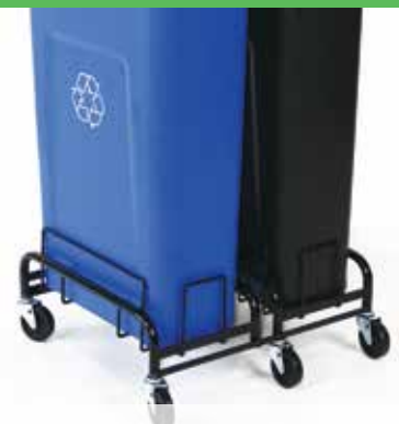
Optional wheel dollies