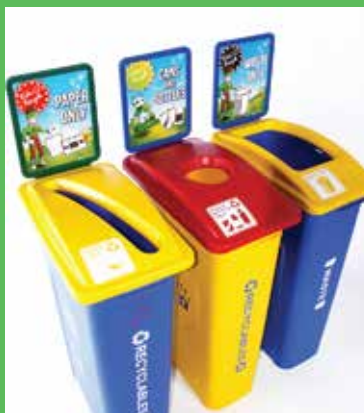
Customized Kidz Waste Watcher available